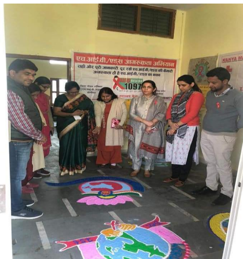
Rangoli Making and Hand printing for instilling awareness among common mass